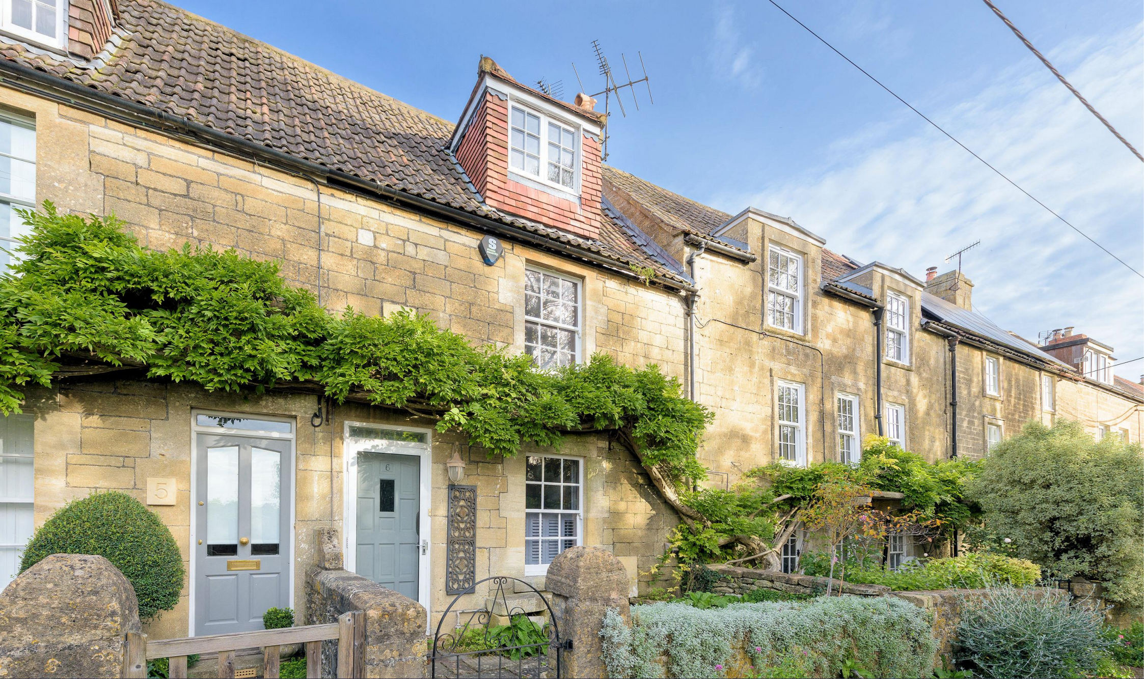
6 Bearfield Buildings Bradford on Avon, Wiltshire, BA15 1RP